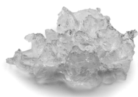
MF 36 Flake ice Residual water content 25%